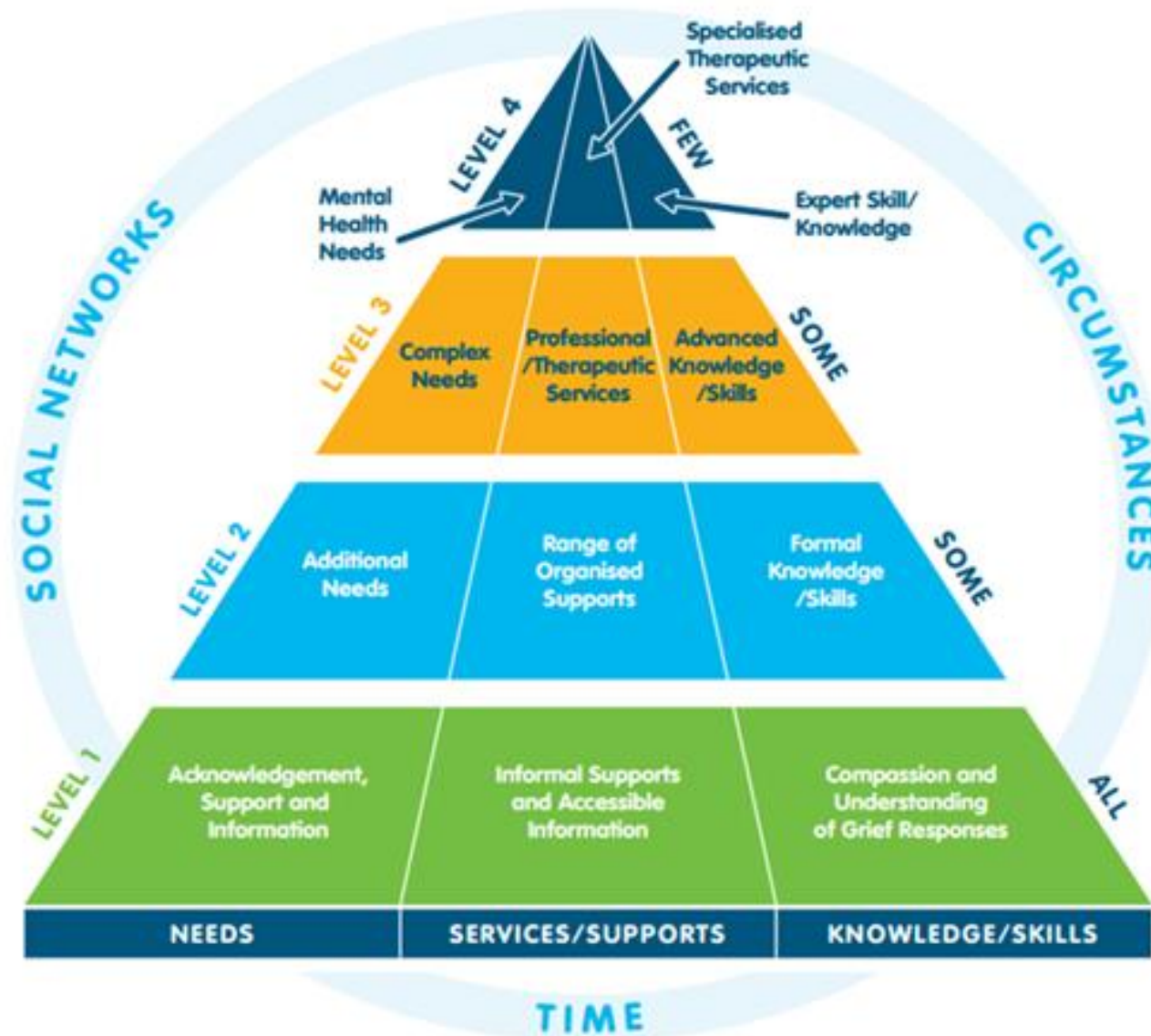
Figure 1 The Bereavement Pyramid based on the one developed by the Irish Hospice Foundation [4]