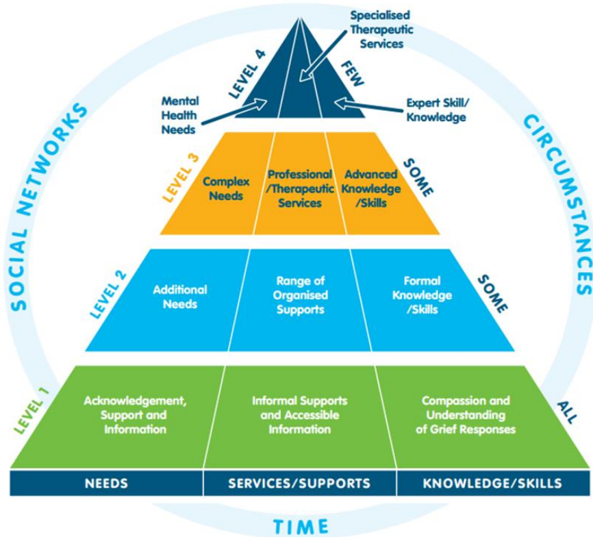
Figure 1 The Bereavement Pyramid based on the one developed by the Irish Hospice Foundation [4]